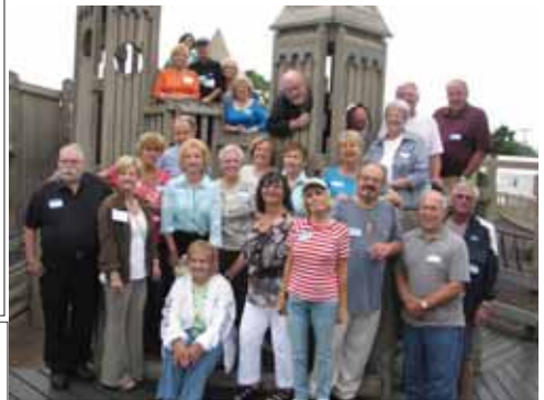
Those from Class of 1961 that survived their 50th Class Reunion ▼