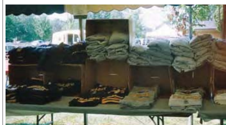
Clothing with the Fraser logo