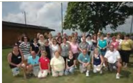
1970 through 1974